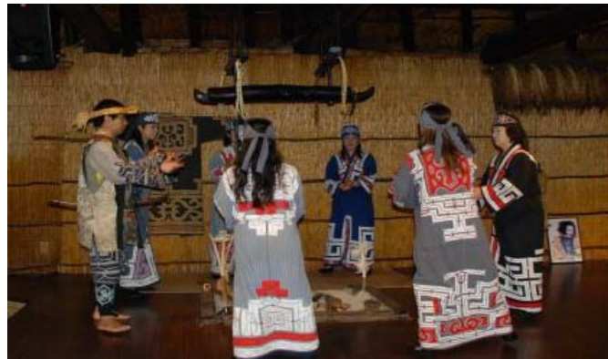
Figure 2: Music performance and dance

Ainu traditional clothes reveal how they were adapted to cold winter. The Ainu produced clothes themselves by using furs, leather, plant fibers that were readily available in the surrounding environment. They also traded for cotton from Japanese people and silk from Chinese merchants.