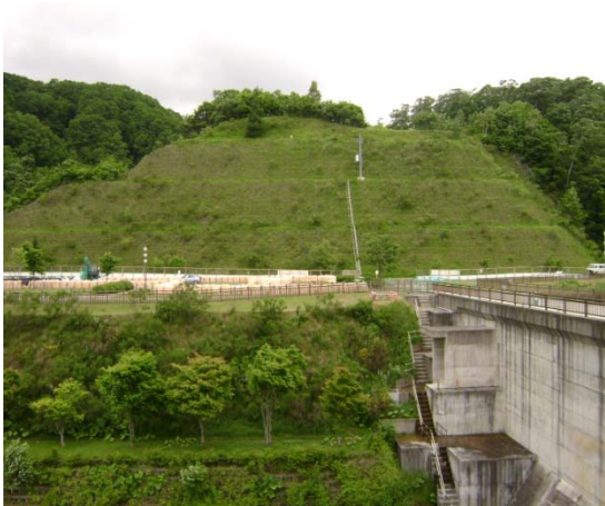
Fig.- God's dancing place (on the top of the hill)

Ainu religion was animist: all beings and many natural objects (e.g., rivers, volcanoes, fire, lightning, trees) were endowed with a spirit. When a living being died, only the material part was gone, and the spirit was freed. The released spirit could be good or evil. It might harm living beings, including people. To avoid the harmful actions of the evil spirits, Ainu used to work on wooded representations of the spirits, with a human form, called inaos. Today, inaos are simple sticks scraped by knife.