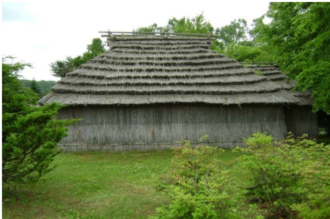
Fig.- Traditional Ainu house

long sleeves. It almost reached feet, and the end was folded round the body, and tied with a girdle of the same material. Women also wore an undergarment of Japanese cotton cloth. In winter the skins of animals are worn, with deerskin leggings and dog or salmon skin boots. Both sexes are fond of earrings, which are said to have been made of grapevine in former times, but were later purchased from the Japanese. There were also bead necklaces called tamasay , which the women prized highly.