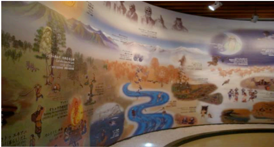
Figure 1: The Ainu's material and ritual life

For the Ainu, deities are indispensable part of their lives. Most of flora and fauna that are important to Ainu livelihood have been considered good deities, whereas pandemics and natural disasters have been regarded as bad deities. The photo above (Figure 1), which was taken in the Ainu Museum in Shiraoi, Hokkaido, describes material and ritual life of the Ainu. This picture shows their strong belief that deities for natural objects may protect humans. This cosmology has created a sense of safety among them in confronting with changes in the natural environment. The Ainu did not unnecessarily uprooted wild plants. Seasonal wild plants, game and seafood could be stored for the long winter and in preparation for difficult times.