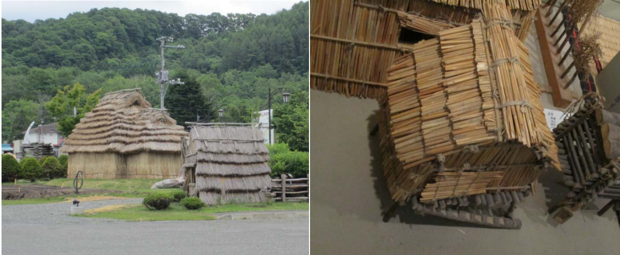
a. The village - Kotan of the Ainu

chopsticks and moustache-lifters when eating; the women have wooden spoons (Japan-101, 2002).